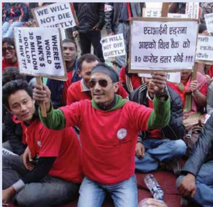
Activists in Nepal