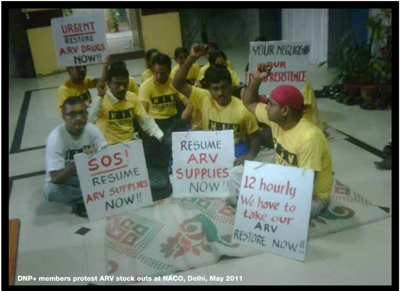
DNP+ members protest ARV stock outs at NACO, Delhi, May 2011

Positive networks in Cambodia, Indonesia and Nepal are responding to the issue of ARV drug stock outs, the distribution of expired medicines and increased forecasts that ARVs will run out. This follows on from similar ARV stock outs across different Indian states earlier this year.