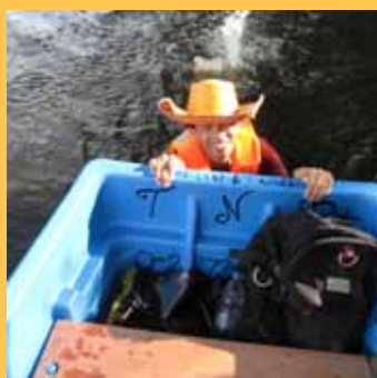
TNP+ flood relief